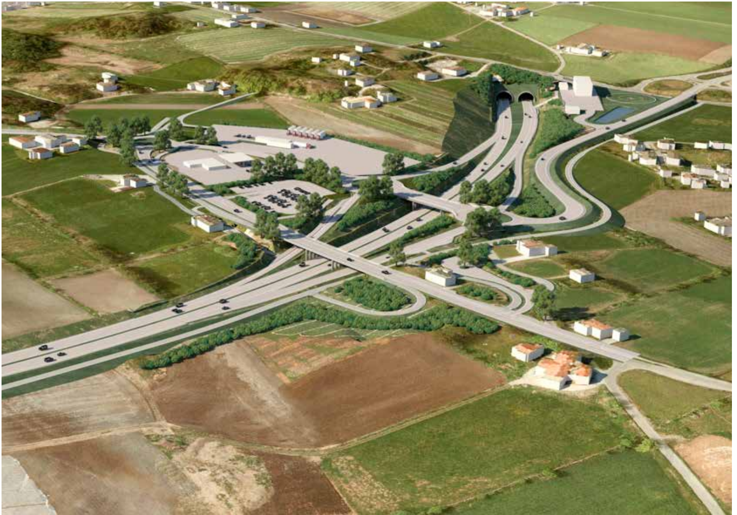
Harestad intersection with the southern tunnel entrance.

ROGFAST IS DESIGNED TO BECOME ONE OF THE WORLD'S SAFEST TUNNELS